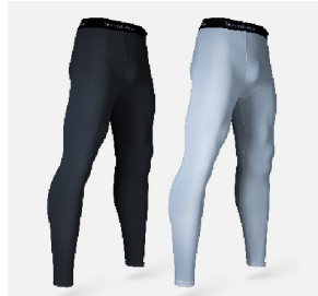
MEN'S PERFORMANCE PANTS