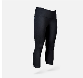
WOMEN'S PERFORMANCE CAPRI