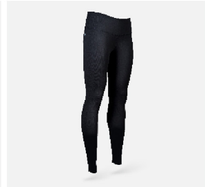
WOMEN'S PERFORMANCE PANTS